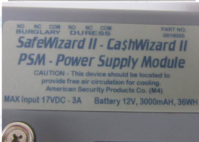
Authenticate the photo on original report only